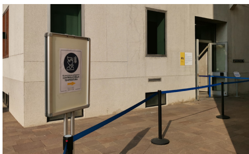
Offices, library and study rooms: Corso Matteotti, 22 - “M2 Tower” building entrance