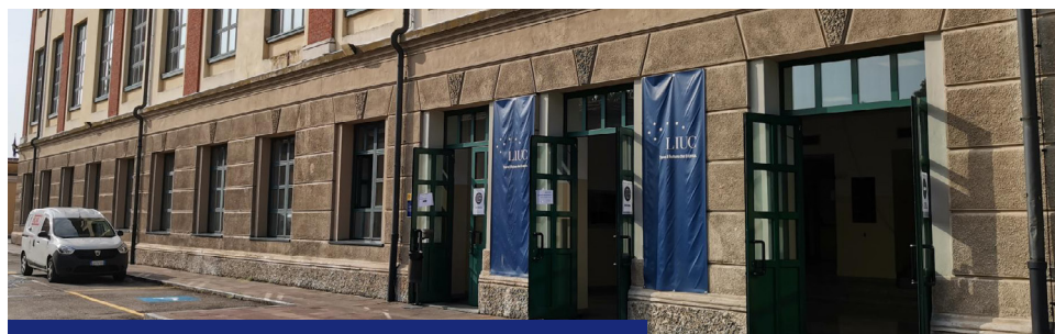
Classrooms: Piazza Soldini, 5 - “Cantoni” building